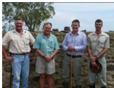
Course leader and Examiners